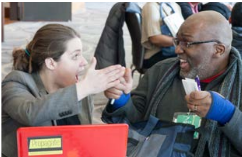
Teacher provides feedback to an entrepreneur at an ed tech summit in Baltimore

Random assignment to create the comparison groups is the preferred approach but is not always feasible, so other matching techniques are often used. It is important to understand and acknowledge their limitations when making claims about the impact or effectiveness of your app or tool.