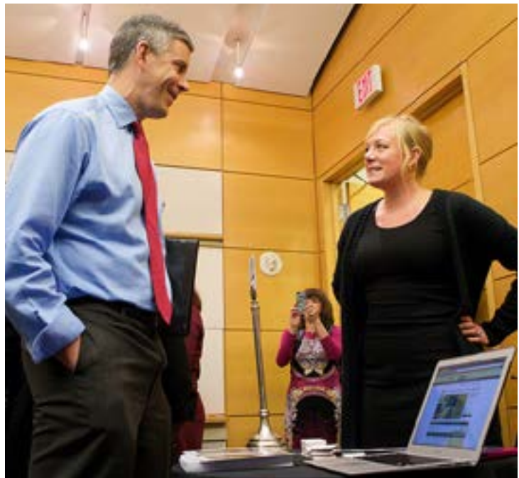
Education Secretary Arne Duncan visits with app developers at an Education Datapalooza