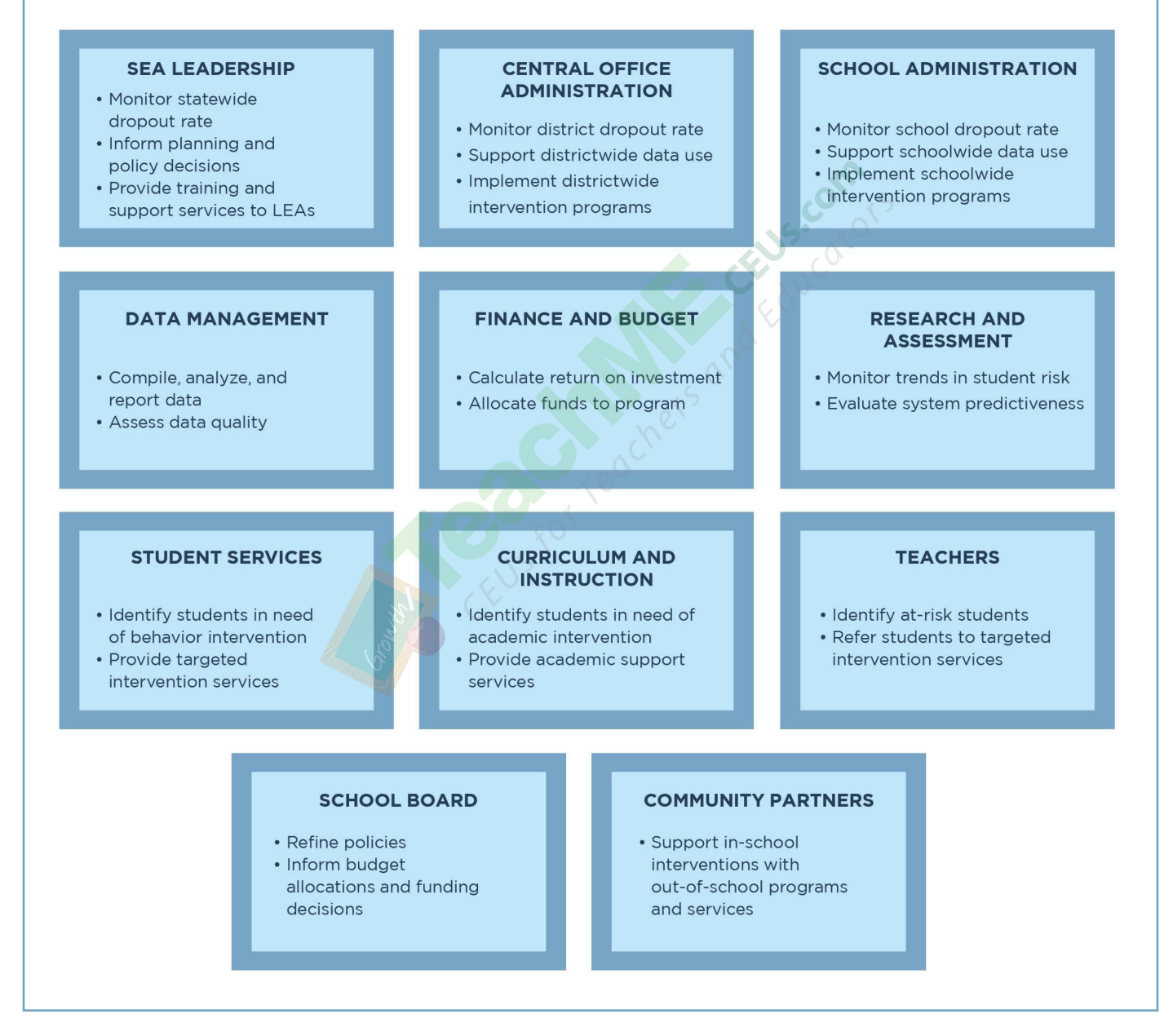
Figure 2. Representative examples of how early warning system data are used by stakeholders

Stakeholder groups may need different types of data to inform action. As illustrated in figure 2, early warning system data may be used differently across an education agency based on the specific information and data needs of stakeholder groups. Staff should be encouraged to engage in data-informed discussions and act using early warning system data. Leveraging existing team-based structures and collaborative activities, such as team meetings, leadership meetings, and professional learning communities, can promote early warning system data use.